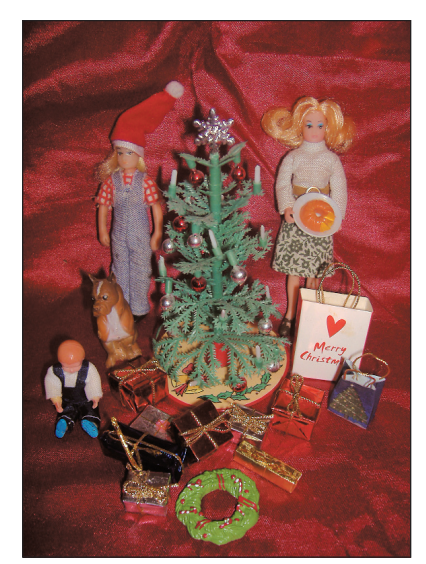
Caitlin's doll's house box of spares yielded a charming scene around the Lundby Christmas tree.