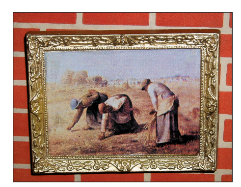
2. "The Gleaners" by Jean François Millet; oil painting 1857. The original is in The

1. "The Reader" by Jean-Honoré Fragonard; oil painting done c. 1770-72. The original is in The National Gallery of Art in Washington, D.C. First shown in the Lundby catalog 1967 and not shown after 1974-75.